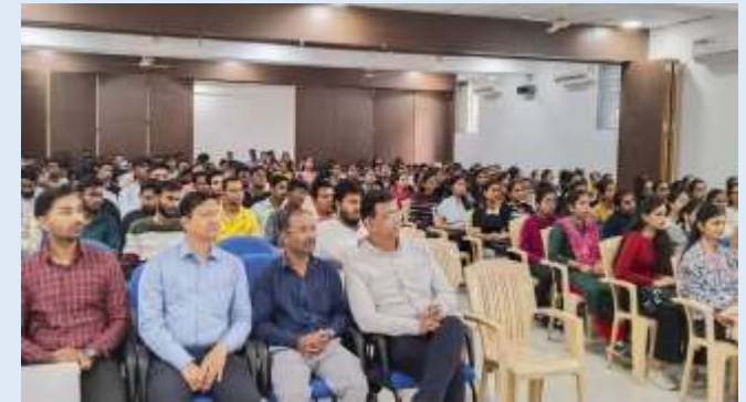
“Mega Job Card Distribution -2023-24”