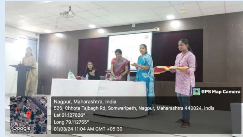
“Workshop on “Fermifood and its Health Benefits 2023-24”