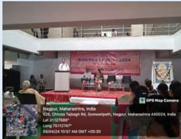
“Business Expo – 2023-24”