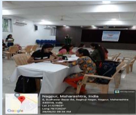
“Mehendi and Nail Art Workshop Session 2022-23”