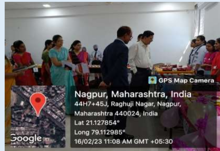
“Workshop on “Fermifood and its Health Benefits 2022-23”