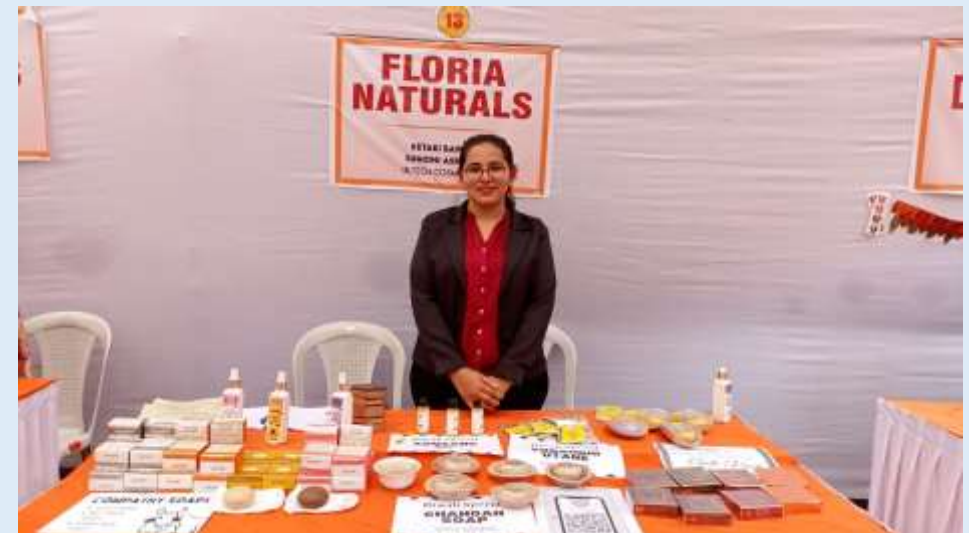
“Business Expo – 2019-20”