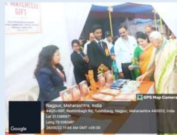
“Business Expo – 2022-23”