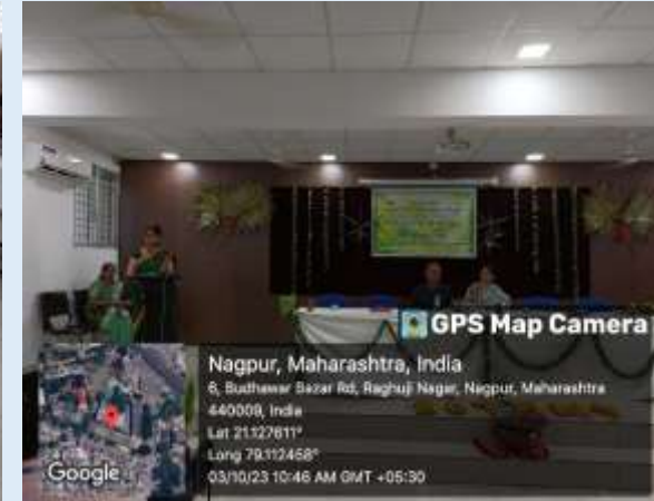
Glimpses of Botany Fest