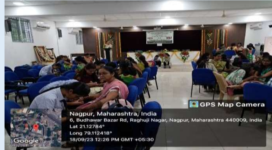
“Mehendi and Nail Art Workshop Session 2023-24”