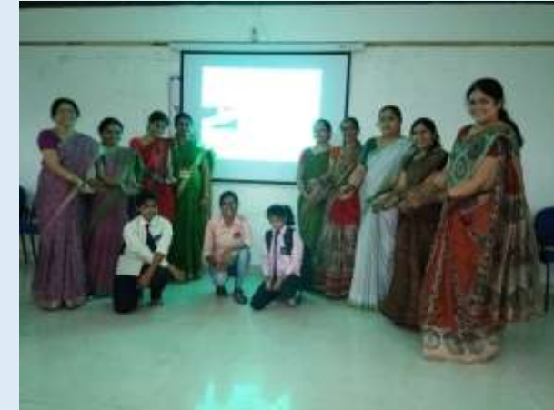
“Mehendi Workshop Session 2019-20 & 2018-19”