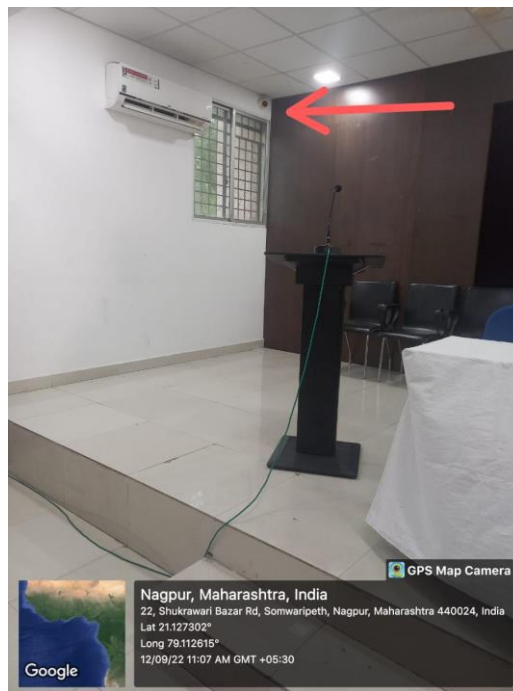
“CCTV Camera in Auditorium”