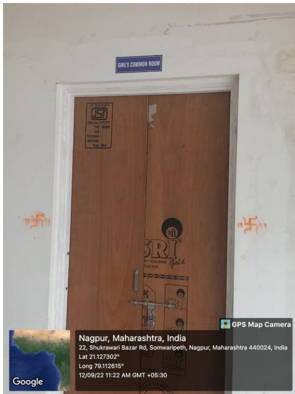
“Girl’s Common Room”