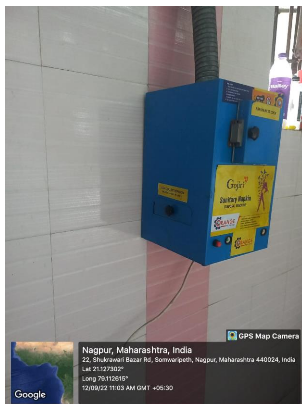
“Sanitary Napkin Disposal Machine in Female washroom – Session 2022-23”