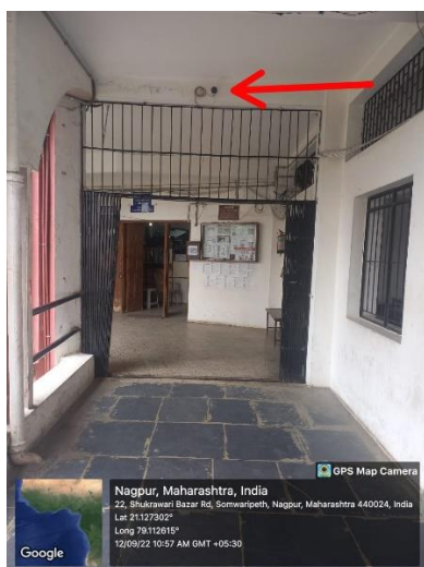
“CCTV Camera in Corridors”