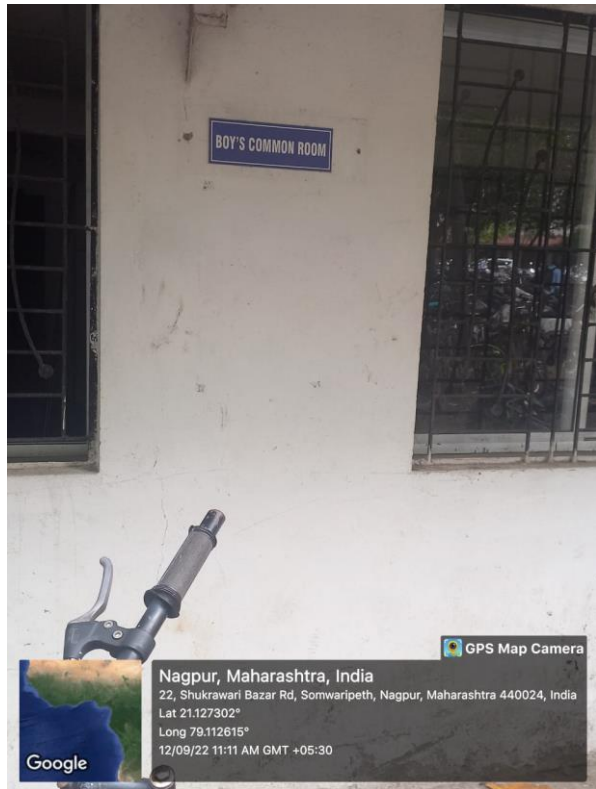
“Boy’s Common Room”