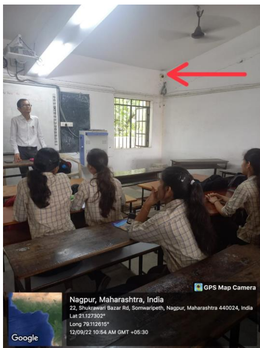
“CCTV Camera in Classrooms”