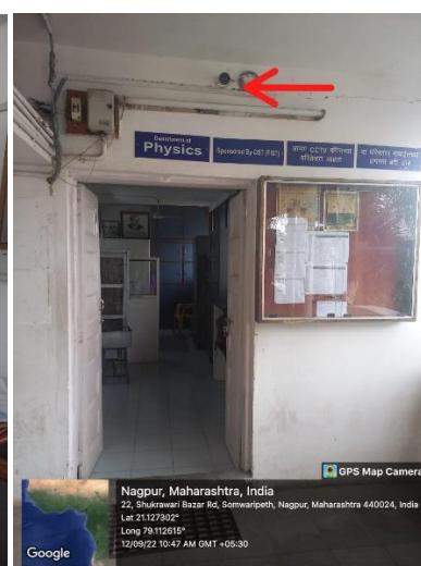
“CCTV Camera in Laboratories”